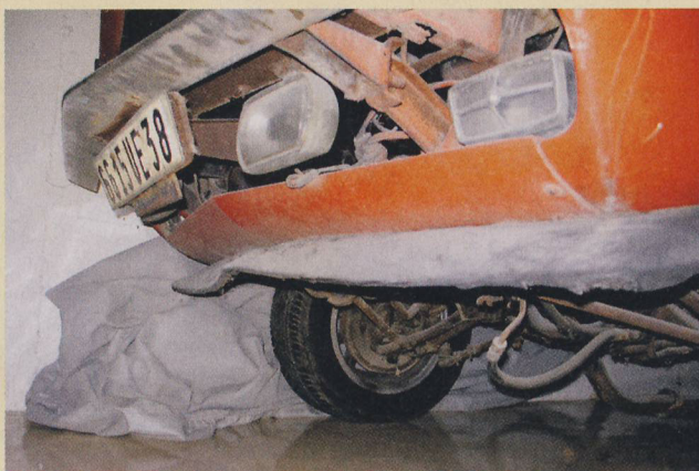
The front chin spoiler was shared with the Boss 302. Even the foglights were intact and original.