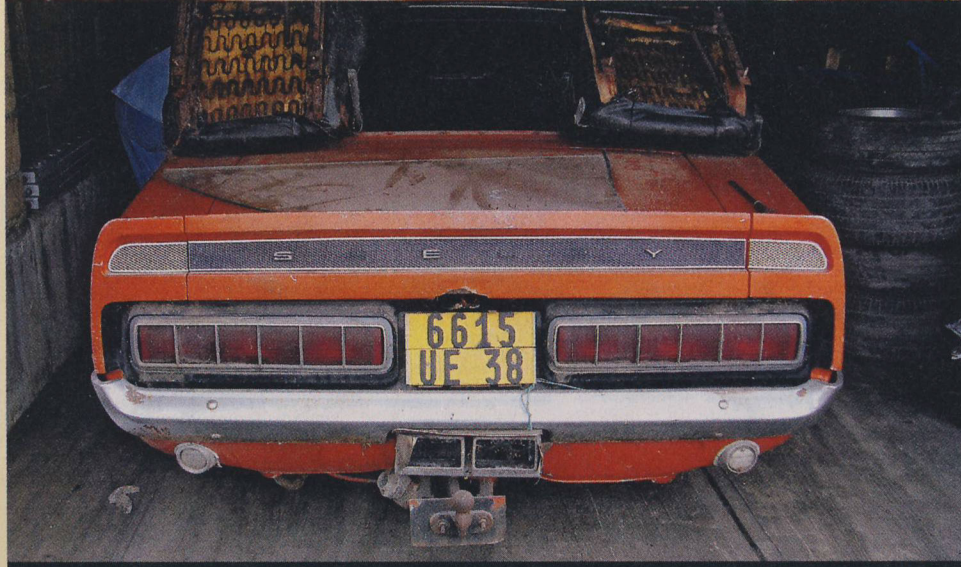
Little is known about the Shelby's activities in Europe, though the trailer hitch and pig-tail offer tantalizing clues.

g new can G.T. Claude Belgium, Shelby ords for an Cobra ilt. re than ew the e or the car with 8. Basi- ed for ward hicle. as lost or perhaps e land. ue when uld of oned on d got that ible." ually by in mebody T. 350, ange hear the r was