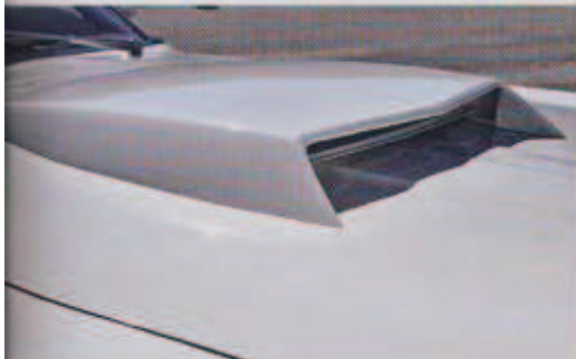
Hood scoop was body color and let the cool air in

Parker found some evidence this car was street driven—a hospital-parking permit on the right front of the windshield. Gapp's wife reportedly drove this car to work daily in Michigan, but not for long. There were