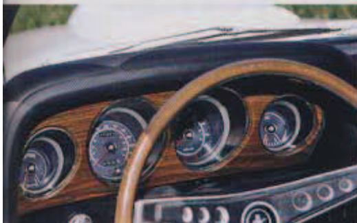
Woodgrain appliques surround full gauge package; high-back buckets are comfortable even if your knees get pushed in due to design; cramped rear seating