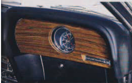
Clock is part of the deluxe interior package