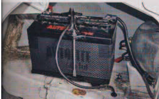
Trunk-mounted battery was raised in rear to avoid spills; flexible tube allowed gases to escape; car looks like a regular 'Stang without exhaust extensions