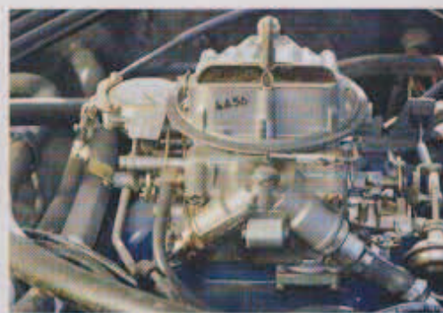
Big Holley fed super premium fuel to the 429 V-8