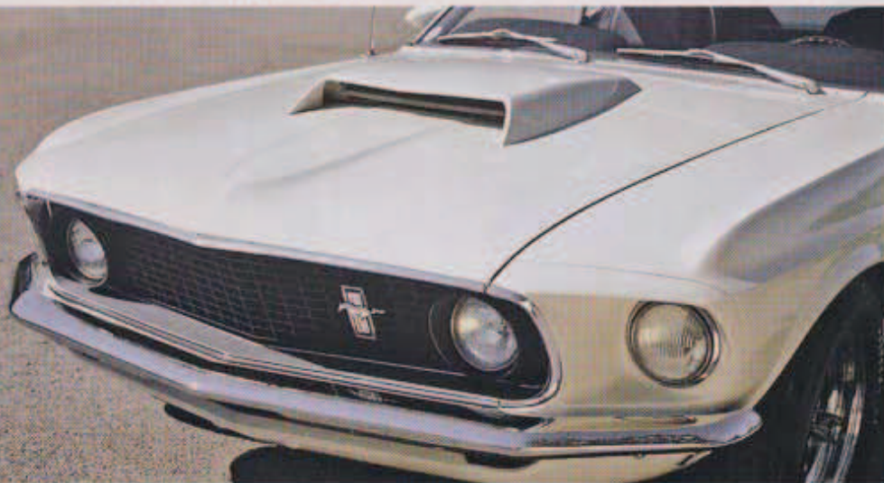
1969 Mustang has one of the most aggressive and identifiable front ends on a Ford performance car

In 1969, the Boss 429 engine set back a buyer $1,208.35. Parker's Boss also has a functional front spoiler; trunk mounted 85-amp battery; high-back bucket seats; four-speed transmission; Traction-Lok dif-