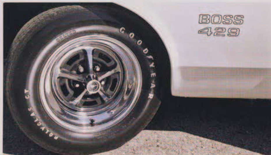
"Boss 429" decals on front fenders are the only exterior badges telling you what lurks under the hood