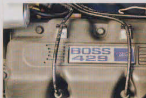
Engine compartment was modified by hand to shoehorn exotic 429 engine in, but fit was still tight; correct NOS spark plug wires can cost up to $5,000

As with all muscle cars, the heart of the Boss 429 was the engine. Everything about the 429 was huge. The intake ports and large-diameter valves were large enough to keep these engines spinning up to 8,000 rpm. The intakes measured 2.28 inches and the exhaust valves were 1.90 inches in diameter. The mammoth hemispherical cylinder heads and rocker covers were aluminum (early versions were magnesium). The crankshaft was a forged-steel unit, which was statically and dynamically balanced. This engine was rated at 375 horsepower but that number was not even close to its potential.